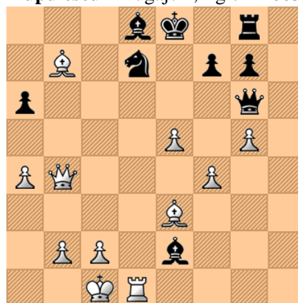
Lupulescu – Bugajski, Zgierz 2005

1. Wd7! Kd7 2. f5! Hg5 3. Hd6 Ke8 4. Gc6x.