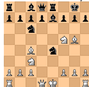
Astapowicz – Gołosow, Nowosybirsk 1967

1. Gf7+! Kf7 2. Hd5+ (A) 2... Kf8 3. Sh6! gh6 4. Gh6x. (B) 2... Kg6 3. Sh4+ Kh5 12. Ge7+.